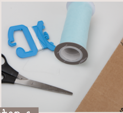
step 1 Find a circle object to trace & create your template.