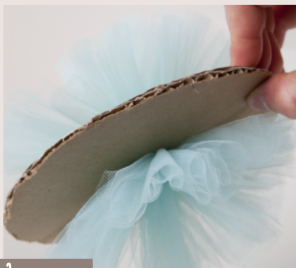
step 7 Your tulle ball will look like the photo.