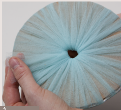
step 5 Trim the two ends to match the template edge.