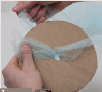
step 4 Keep wrapping until all the tulle is around the templates.