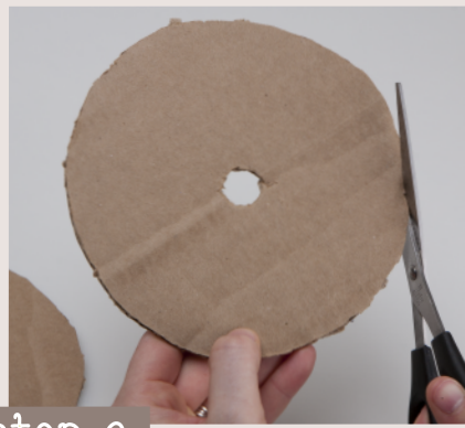
step 2 Cut 2 cardboard circles with holes in the center.