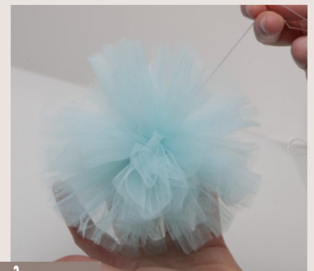
step 9 Fluff and hang to decorate!