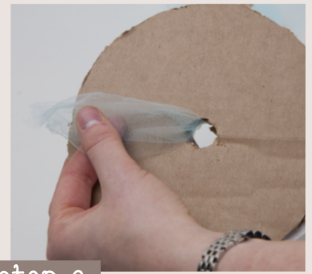
step 3 Thread one end of your length of tulle through both templates.